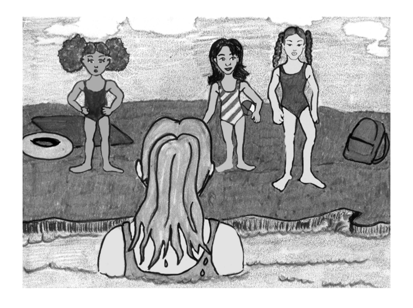
She came up, and there were her pals. They said, "Are we late?"