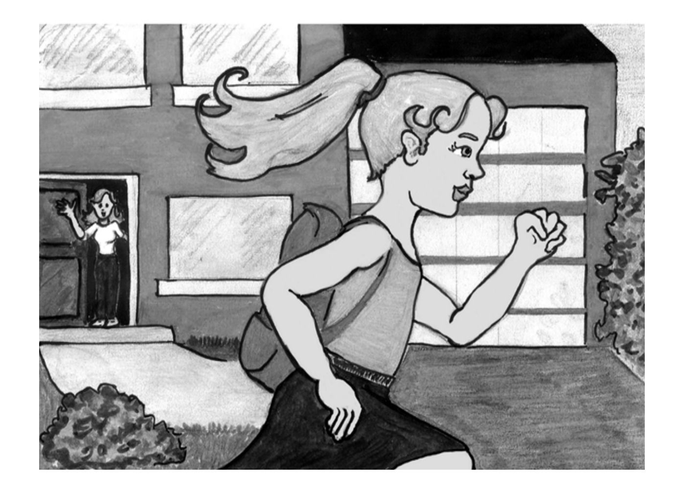
Bess ran. She had a date. She said, "I am late! I hate to be late!"