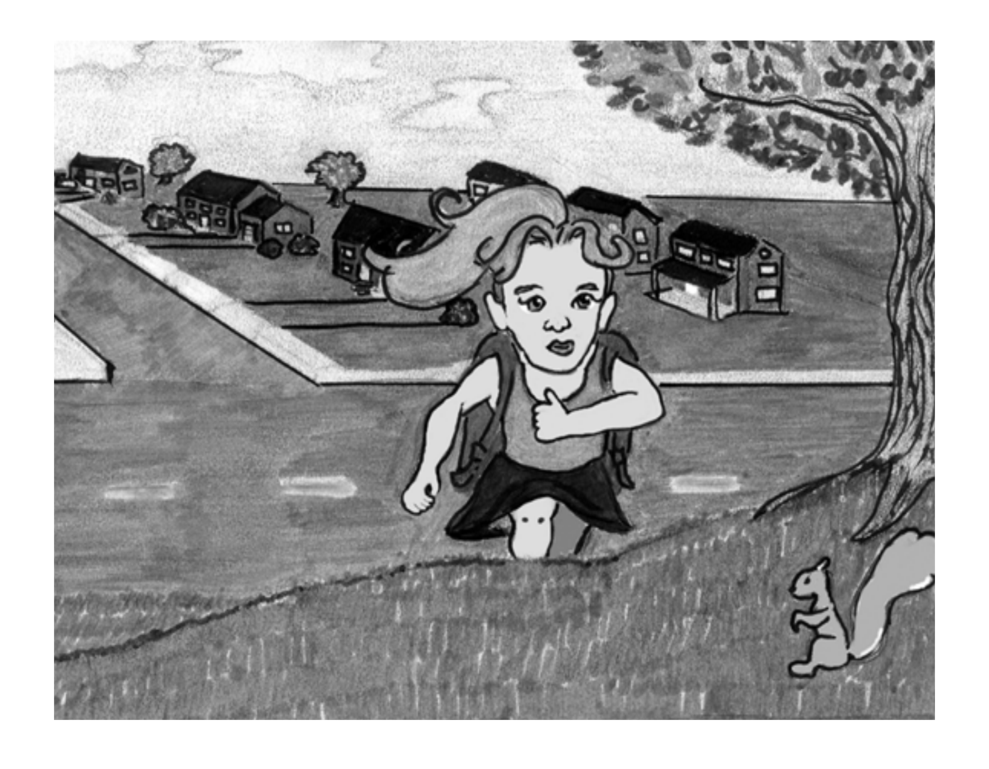
She ran from her home. She ran up the hill. She ran and ran. It made her legs sore.