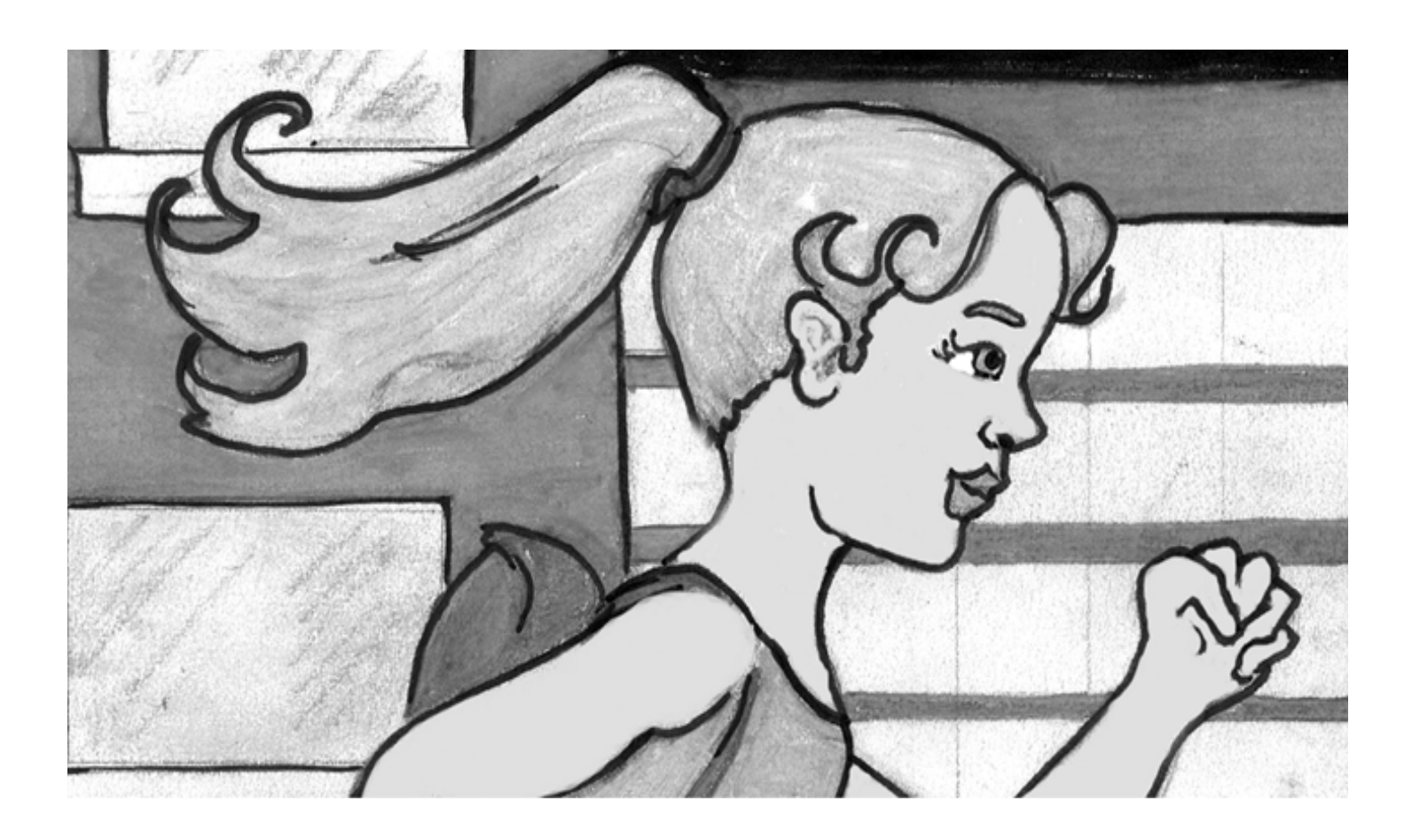
Bess Runs Late